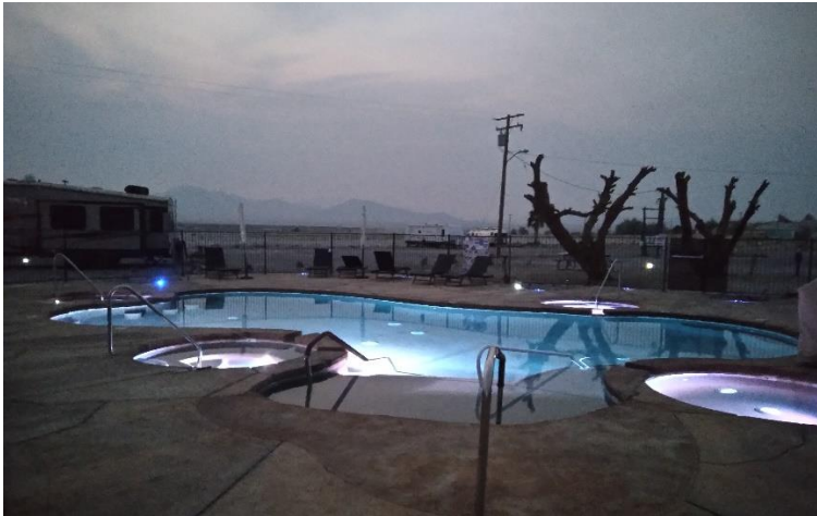
New Hot Springs Pool at Delight's Hot Springs in Tecopa, CA